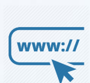
公司網站 company website