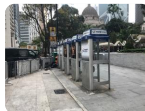
Public payphone kiosks