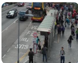
Sheltered bus stops